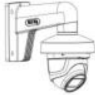
DS-1272ZJ-110-TRS Wall Mount